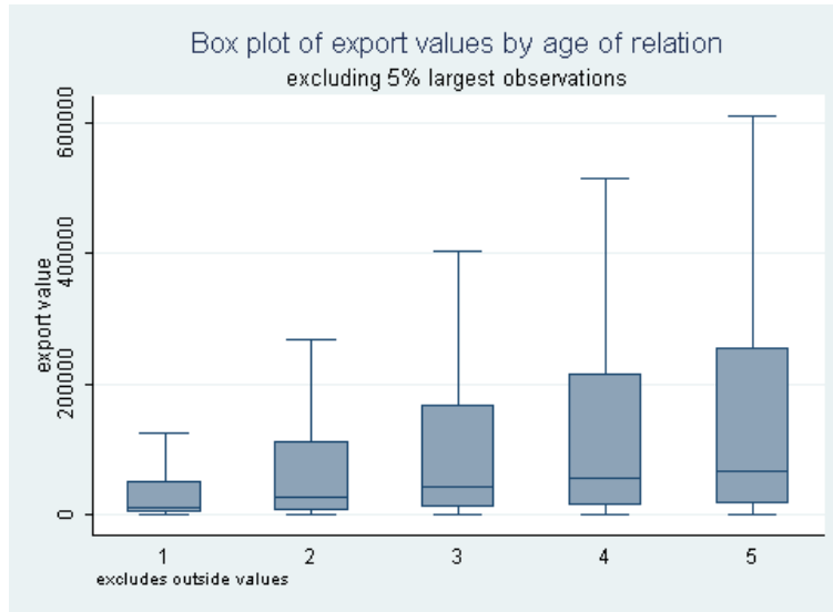
Figure 2: Export value distribution by relationship age. The figure shows box plots of export values on the vertical axis and relationship age on the horizontal axis.