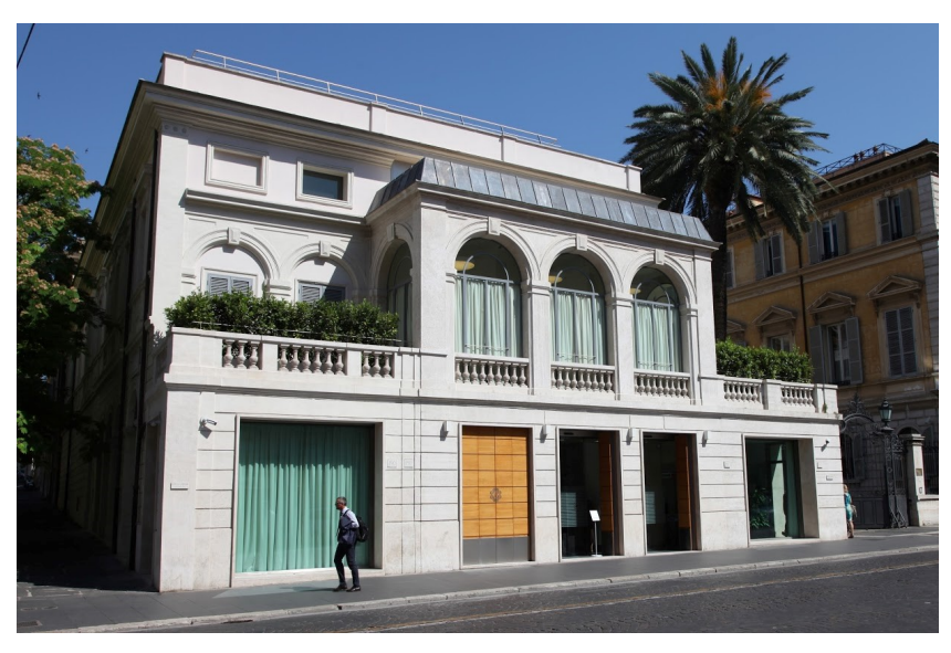
Banca d' Italia's conference centre 'Carlo Azeglio Ciampi'

The working language is English. Participation is free of charge.