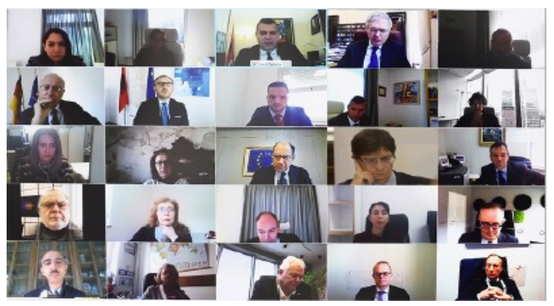
Closing Ceremony of the Twinning Project, 18 January 2021

in the domain of Supervisory and macroprudential regulation, new provisions aligned with EU standards were introduced relating to capital adequacy. In addition, several recommendations issued by the European Systemic Risk Board were implemented;