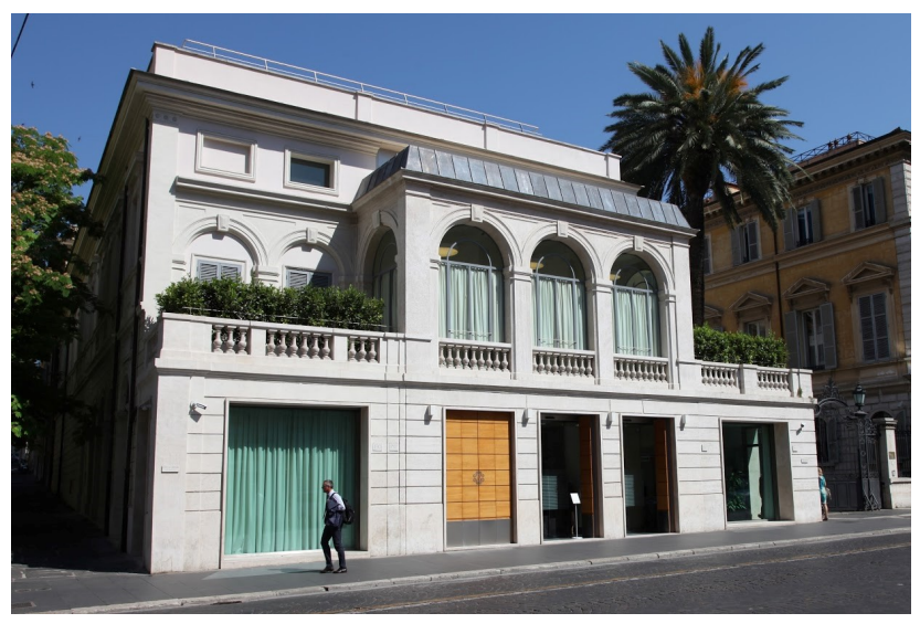
Banca d'Italia's conference centre 'Carlo Azeglio Ciampi'