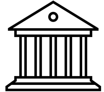
PARIS SCHOOL OF ECONOMICS

WE ALSO GRATEFULLY ACKNOWLEDGE THE SUPPORT OF THE ARCHIVIO STORICO DEL BANCO DI NAPOLI AND OTHER ITALIAN ARCHIVES & LIBRARIES