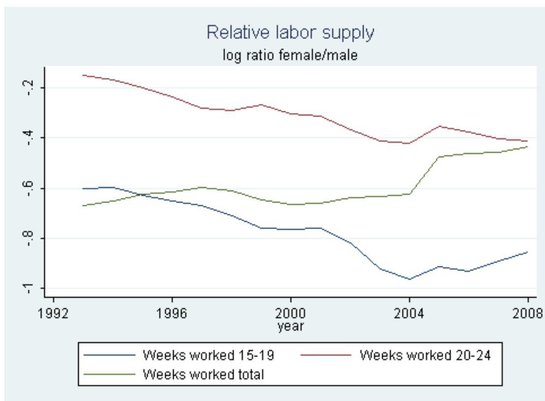
Figure 2: Relative labor supply

In order to get cross-province variation, we interact the number of draftees with sex-ratios at birth, computed using historical population data from the National Statistical Institute (Istat). We construct sex-ratios at birth for individuals in a given cohort by taking the past number of newborn boys and girls in that province. The sex-ratio at birth for the cohort of individuals aged 15-19 years old in year x in province j is thus defined as the ratio between female and male children born x - 19 to x - 15 years before in province j . In figure 3 we plot sex-ratios at birth for the age class 15-19 for a few provinces. Given that our historical population data only starts in 1970, we compute mations concerning the criteria that were used to select draftees according to their residence. This is due to the fact that, in principle, service was a duty for everyone. Each municipality had to compile a list of all eligible individuals, randomly ordered, which was then to be used by the military administration.