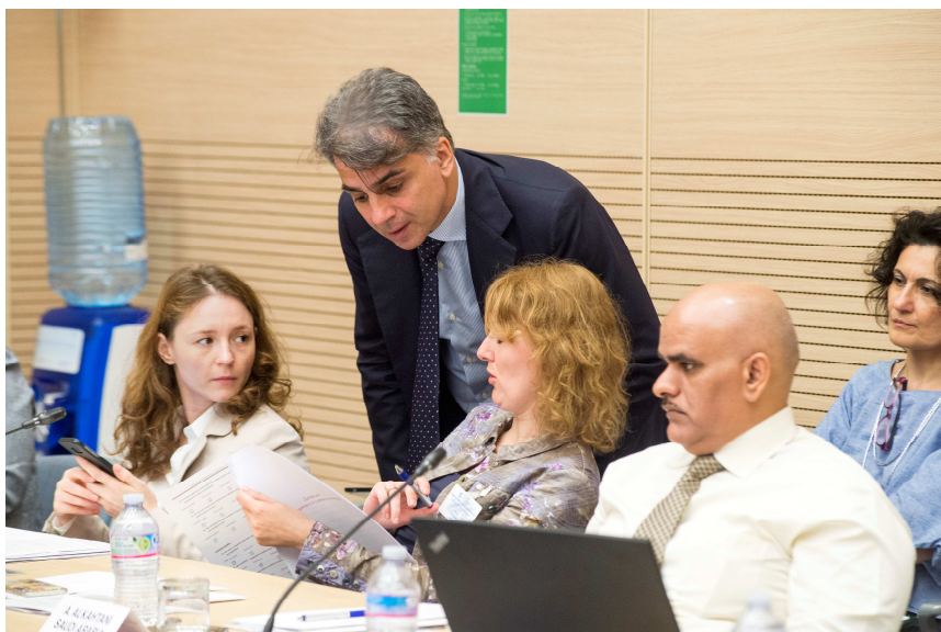
Seminar on Central Bank Communication in a Dynamic Environment

for a more widespread circulation of information within the same organization and made cross-functional collaboration easier and more efficient, breaking down boundaries between functional areas