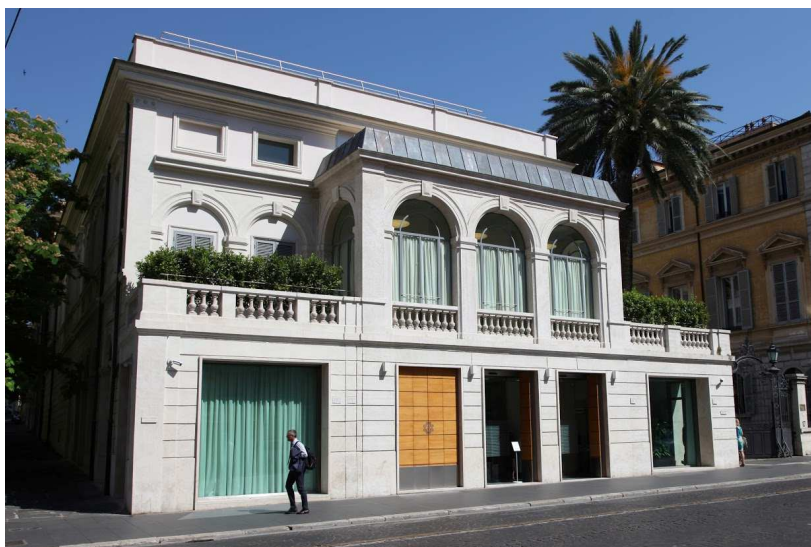
The Bank of Italy's new conference centre