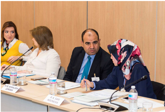
Workshop on Internal Control and Risk Management in a Central Bank

ternal control and risk management, as confirmed, among others, by the presentations delivered by the representatives of the Bank of Mexico and the Saudi Arabian Monetary Authority.