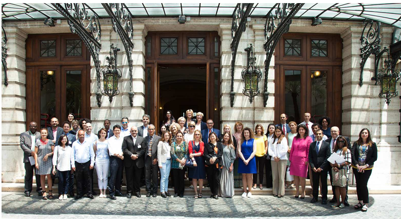
Seminar on Central Bank Communication in a Dynamic Environment

portance of engaging the public in a continuous dialogue, which does not necessarily translate into a disintermediation of traditional media outlets, but recognizes the media industry's role as a gatekeeper of information and the need to widen the scope and outreach of communication activities. The fragmentation of the media and the increasing gap between credible information and entertainment have reduced the ability of the general public to contextualize the information it consumes and have made it more vulnerable to volatility and risks. Central banks recognize that a better-informed public, especially on financial and economic matters, is far more likely to make sound financial decisions and understand the role of central banks in a market economy.