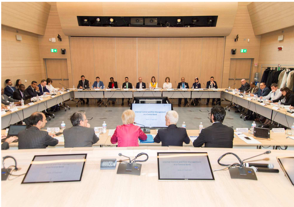
Workshop on Internal Control and Risk Management in a Central Bank

In this context, the key word is cooperation. The effectiveness of such a model relies on rigorous cooperation between the lines. Such cooperation may be achieved through progressive stages. In