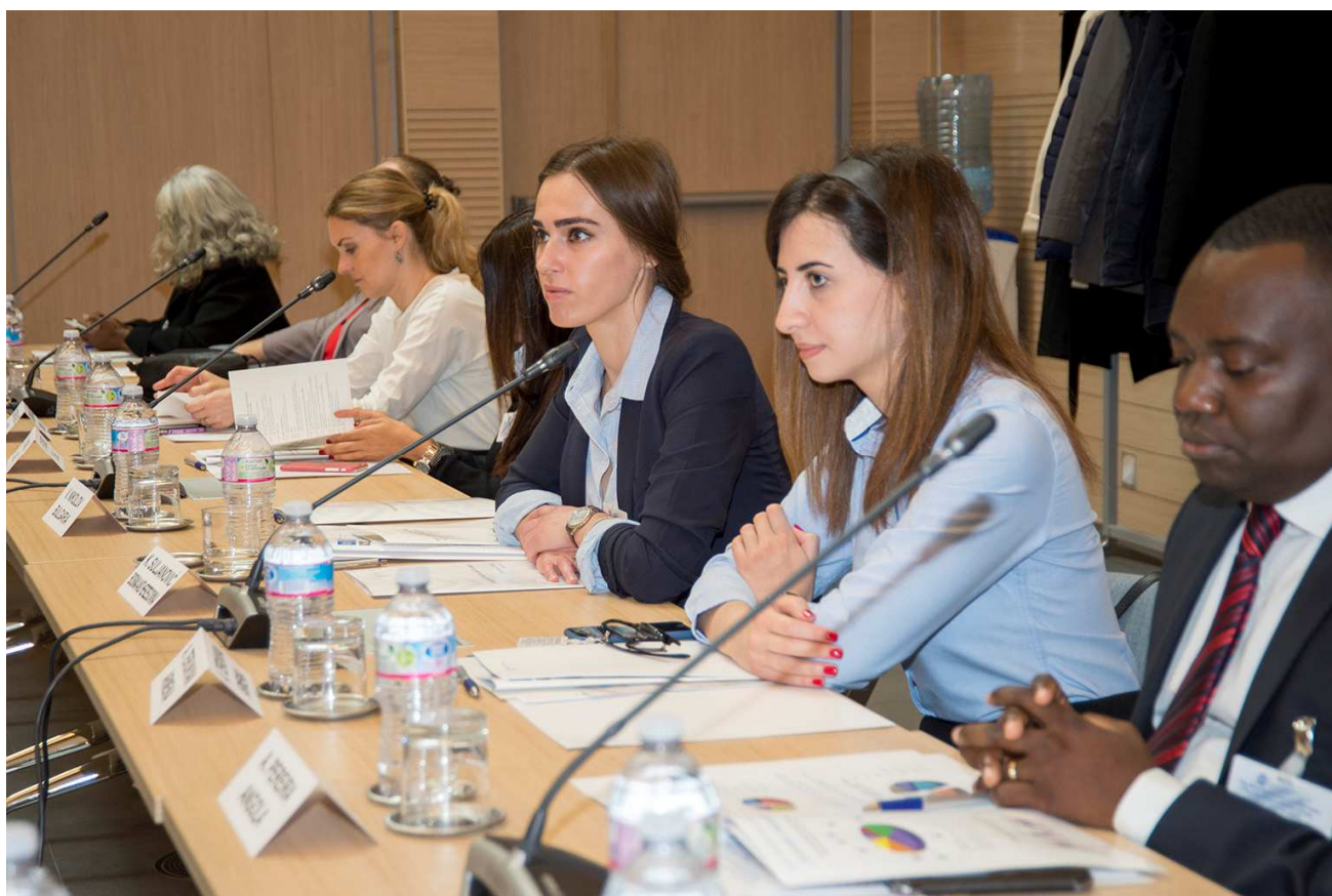
Seminar on The Legal Function in a Central Bank: the Experience of the Bank of Italy

Particular attention will be devoted to: the tools available to safeguard the effective conduct of monetary policy; the smooth provision of liquidity to market participants; the orderly functioning of financial markets; related financial stability issues; and the implications for central banks' asset and liability management.