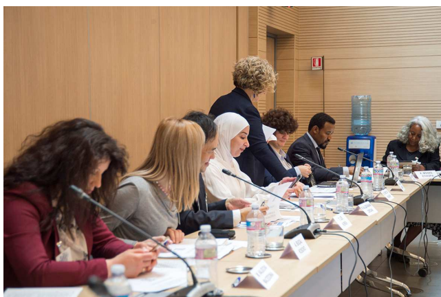
Seminar on The Legal Function in a Central Bank: the Experience of the Bank of Italy

Soft law acts are issued by technical bodies that are not connected to political institutions participating in the legislative process; thereby, soft law acts are not binding per se. Their strength derives either from being produced by the regulated entities themselves, or by the depth of the analysis underpinning them.